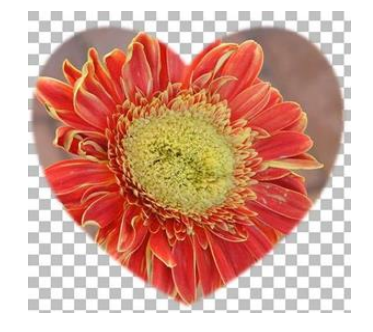
Flower in a heart and a Robin cut out of a picture to paste in another picture

Infilled letters, clip art, wave text and frame.