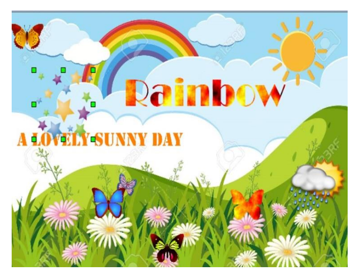
Butterflies, Sun, Stars, Rain shower, colourful text